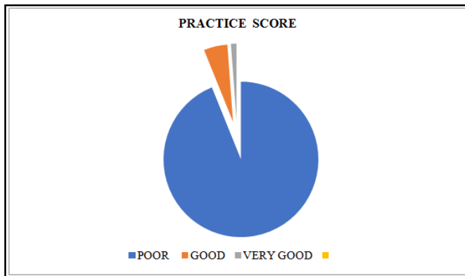
FIGURE 11 -PIE DIAGRAM SHOWING FREQUENCY AND PERCENTAGE DISTRIBUTION OF PRE-TEST AND POST-TEST PRACTICE CHECK LIST SCORE REGARDING THE USE OF INCENTIVE SPIROMETRY AMONG POSTOPERATIVE CARDIAC SURGERY PATIENTS.