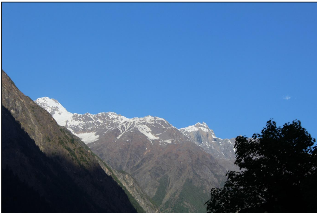
PHOTO- 1 OVERAL LANDSCAPE OF THE SITE NEAR BAIDRINATH HIMALAYAN. DURING SUMMER THE ICE COVER SEEN OVER THE TOP BARE ROCKS , THE AMOUNT OF ICE COVER INCREASES AT NIGHT AND SOME PARTS SEEN BY MELTING ICE CAPS DURING DAY HOURS. DURING THE WINTER ENTIRE BAIDRINATH SHRINE ARE COVERED WITH SNOW AND HIMALAYAN VULTURES SHORTLY MIGRATE DESCENDING THE LOWER HIMALAYAS.