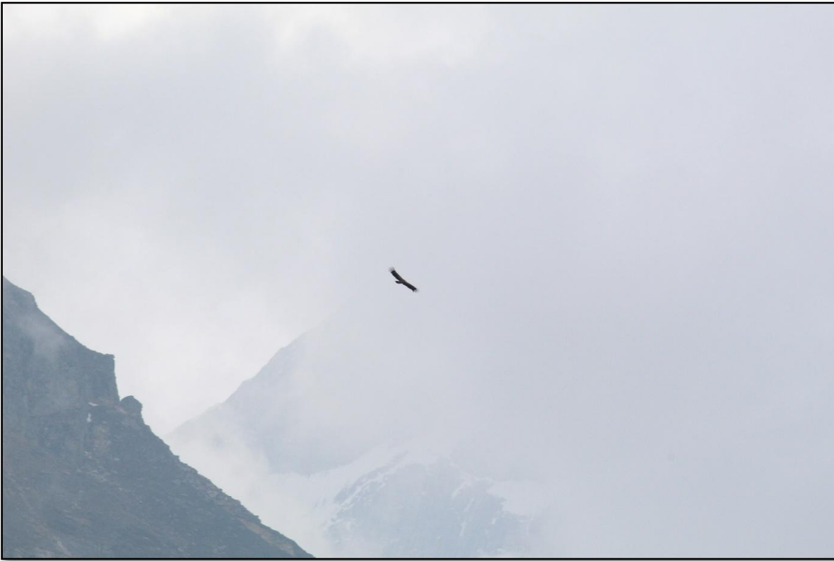
PHOTO-3. HGV HOOVERING OVER ICE FALLEN AREA THROUGH CLOUDS AND MIST IN BAIDRINATH AREA ( ELEVATION APPROX. 3400M)