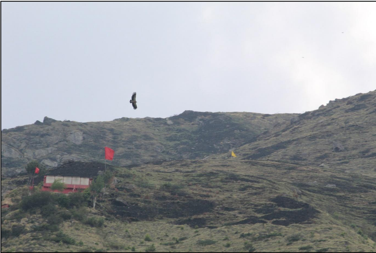
PHOTO-5 HGV.LANDING TOWARDS A ROOSTING SITE NEAR BAIDRINSTH TEMPLE SITE- WESTERN CORNER WITHOUT HUMAN MOVEMENT AREA. ROCKY LANDSCAPE WITH SCRUB VEGETATION AND WITHOUT ICE DEPOSITS.