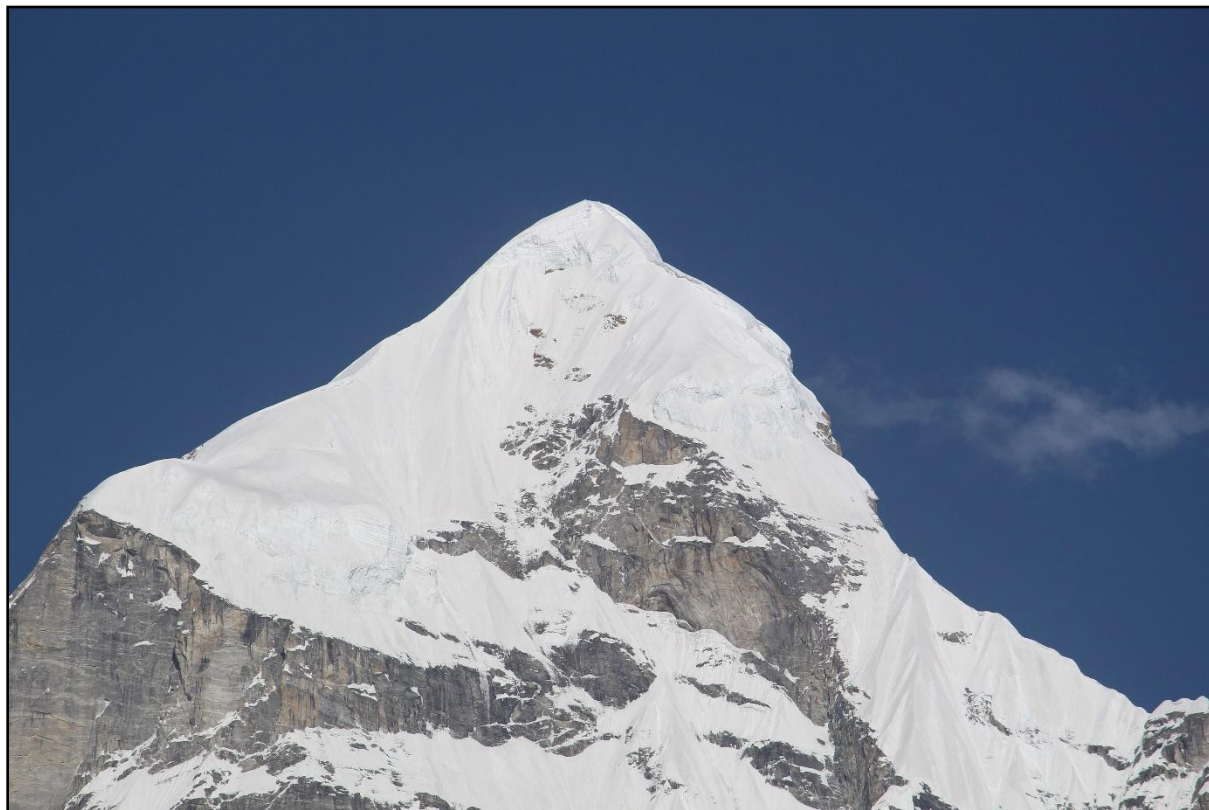
PHOTO- 2. ICE CAPPED HIMALAYAS JUST BEHIND WEST OF THE BAIDRINATH SHRINE AREA. ELEVATION APPROX. 4000-4200M.