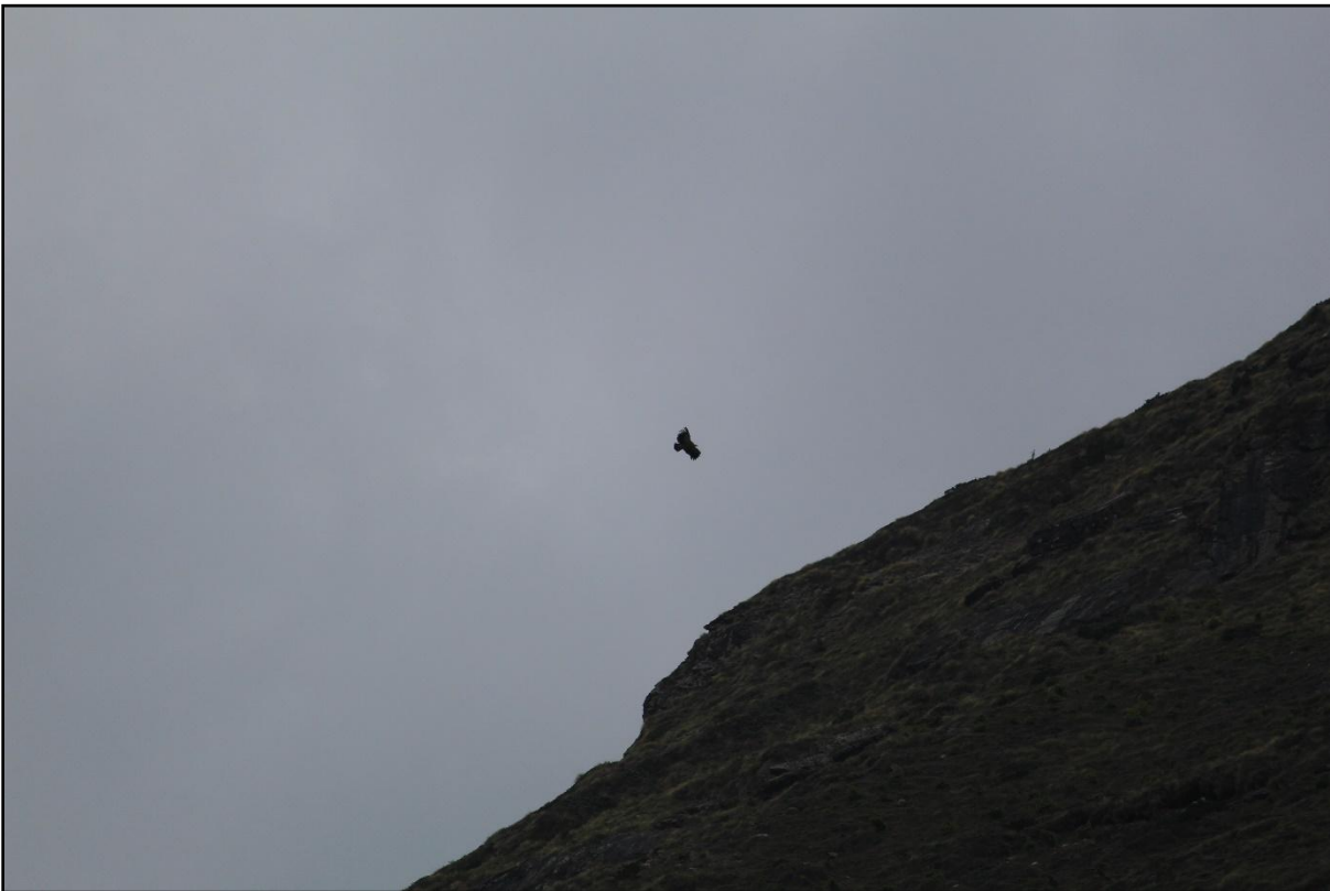
PHOTO-4 HGV. SHORING FOR LANDING IN HILL TOWARDS A ROOSTING SITE WEST OF BAIDRINSTH TEMPLE