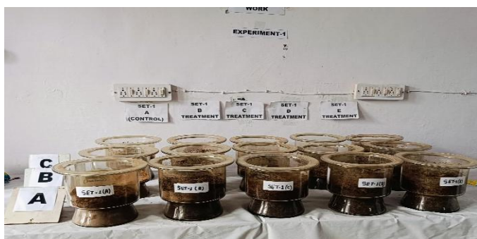
FIGURE 2: EXPERIMENTAL SETUP FOR SOIL SAMPLES ALIQUOTS A, B AND C

Each pot contained 1 kg of contaminated soil collected from the lignite mining area. The amendments were thoroughly mixed with the soil to ensure uniform distribution. The experiment was conducted under controlled laboratory conditions, and soil samples were