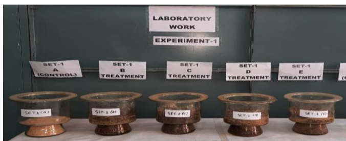
FIGURE 1: EXPERIMENTAL SETUP FOR SOIL SAMPLES